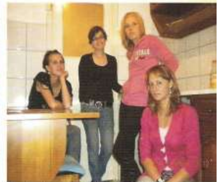
Aspirations - my future - in the apartment