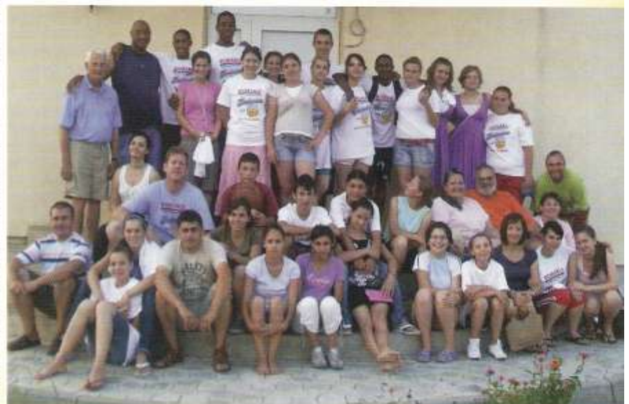
with the Christ Church of Oakbrook Basketball team at Deborah 2

MISSIO LINK INTERNATIONAL O.P. 16, C.P. 1184-1185, 300960 TIMISOARA, ROMANIA, tel./fax: +40 356 420 475, e-mail: missio.link@gmail.com , www.missiolink.org , www.romaniachildrenatrisk.org