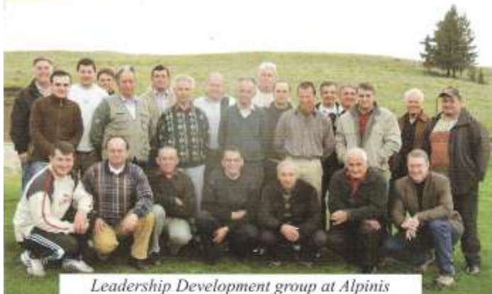
Leadership Development group at Alpinis