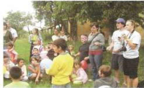
VBS with West Park Baptist, Knoxville, at Stanciova