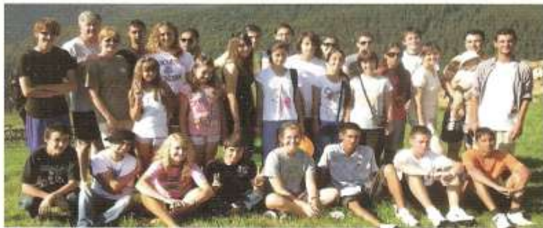
ZPC team and youth from Giurgiu at Alpinis

Over the summer we had seven camps at Alpinis. Five of the camps were at the villa with youth groups from Giurgiu, Fetesti, Bucharest and the girls from Deborah House. The teams from Zionsville Presbyterian Church, IN and Christian Life Fellowship, Baton Rouge, LA, have done a great job helping us with camps. Thank you!