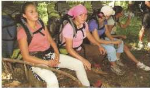
Alpinis outdoor camp - catching our breath